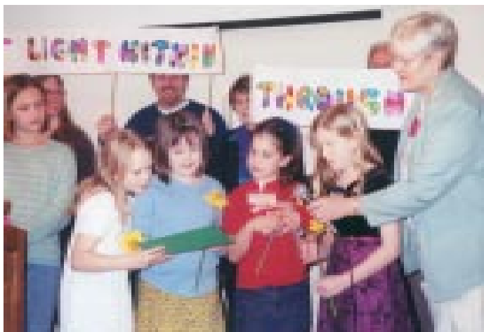
Members of the Youth Advisory Team and Unity youth share the team's new mission statement with the congregation.

To help children and youth awaken To the Christ light within Through play, prayer, and the joyful giving From our loving church community.