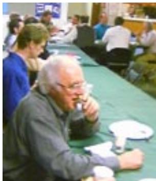
Men's Ministry members hold potlucks at their second Monday gatherings.

These gentlemen were so determined to do a good job on the Mother's Day service, they sandwiched in two extra meetings between the regular