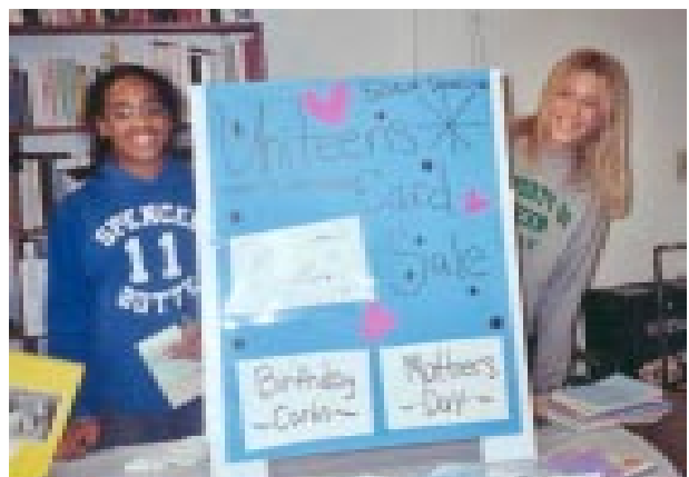
Uniteens sell Mother's Day and birthday cards after church to support their Heifer International water buffalo project.