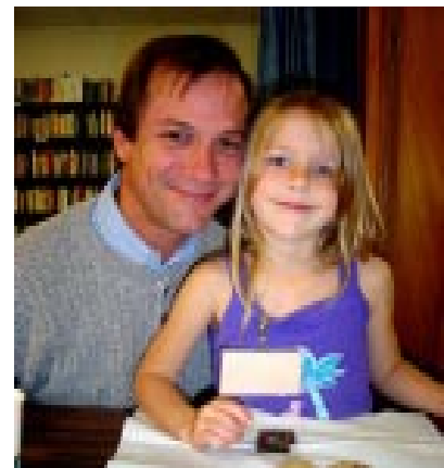
We celebrate the loving energy Unity fathers give to their kids.