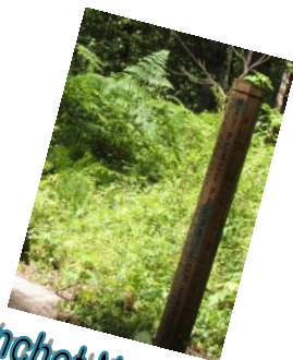
Gifford Pinchot Nat'l Forest

For more information and for pricing pick up a registration pack at the sign up table in the Fellowship Hall.